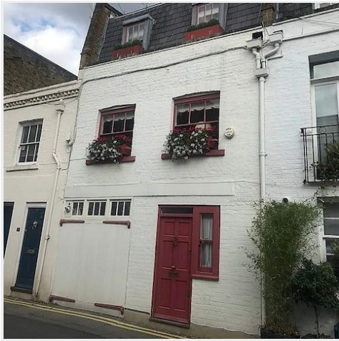
The mews house in Belgravia, central London

She has provided several accounts of the first incident, alleged to have taken place at Maxwell's mews house in Belgravia, central London, after she was trafficked from the US by Jeffrey Epstein, the convicted sex offender who later took his own life while awaiting trial on further charges.