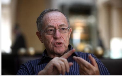
Attorney Alan Dershowitz consistently denied the allegations

Mr Dershowitz, who has represented the former president Donald Trump, Jeffrey Epstein, OJ Simpson and a host of other prominent figures in his long legal career, always fiercely denied the accusations.